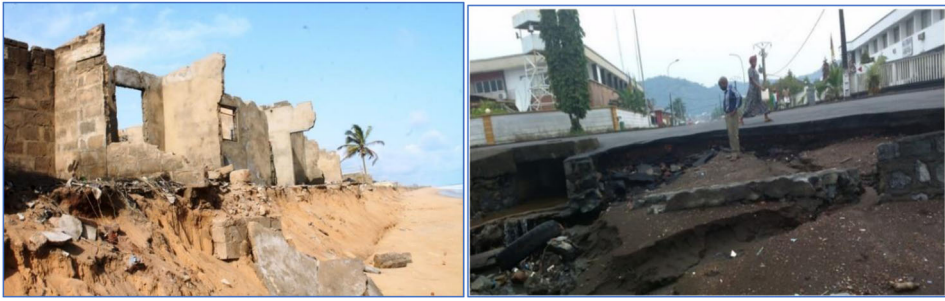
Figure 2. Right: Disappearing buildings in Aneho, Togo (Addeh 2015). Left: Marine Erosion of the coastal highway in Limbe, Cameroon (Kometa et al. 2016).

of 0.75 km 2 of beach land for a period of 10 years (1999–2009), representing an annual inundation rate of about 0.075 km 2 along the area. Based on this, the authors projected a complete disappearance of the beach and a consistent loss of built-up areas into the ocean before 2029 (Fashae and Onafeso 2011). Boateng (2012) posit that the presence of lagoons bordered by settled barrier beaches worsens the impact of SLR on surrounding coastal communities.