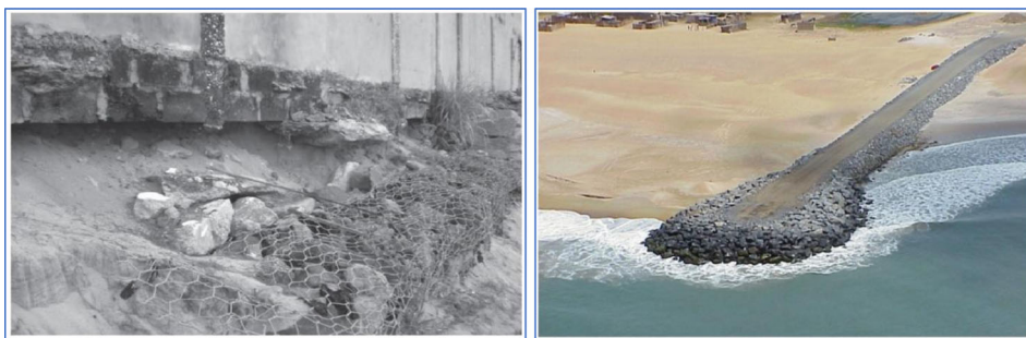
Figure 3. Passive adaptation (left): using rocks in human settlements on the Benin coast (Dossou and Gléhouenou-Dossou 2007). Active adaptation (right): groins along Keta in Ghana (Angnuureng, Appeaning Addo, and Wiafe 2013).

In Ghana, construction of coastal defence wall is the main adaptation strategy adopted by the government. Most inhabitants along the coast resort to temporary relocation due to coastal flooding or inundation (Evadzi et al. 2018). Coastal protection measures for adaptation in Senegal