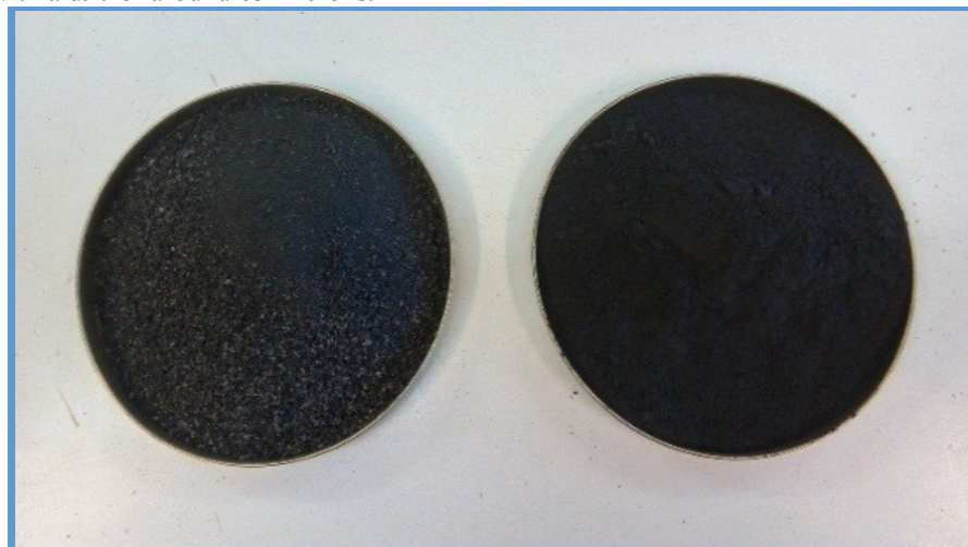
Figure 2:- CBA 0/2 mm on the left and 80 µm on the right.

For the CBA curve 80 µm, d90 = 64.84 microns. The latter is very similar to that found by Savadogo (Savadogo and al., 2015), also with a d90 of around 65 microns.